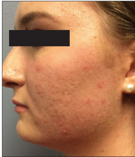
Figure 2: Six years later, note the active acne as well as acne scarring before subcision and sublative treatments.