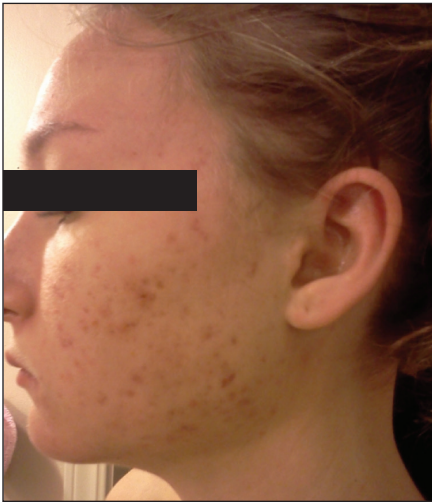
Figure 1: Initial presentation in 2011. Note the red, brown, and flesh toned atrophic, indented/inverted papules consistent with acne scarring.